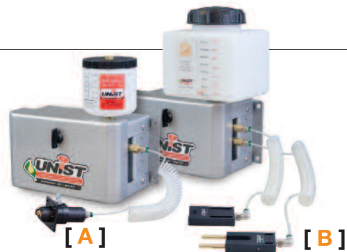
A: The Bat nozzle is easily mountable on band saw or circular saw housing.

Without the need for flood coolant on its saws, TTX not only doesn't need to deal with unruly residue but also less lubrication overall. Before adopting a Unist system,